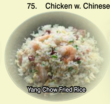
Yang Chow Fried Rice