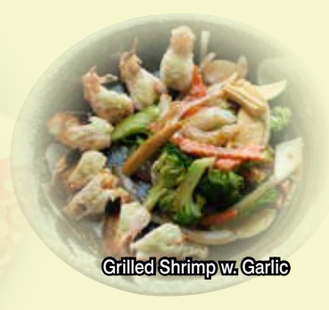
Grilled Shrimp w. Garlic