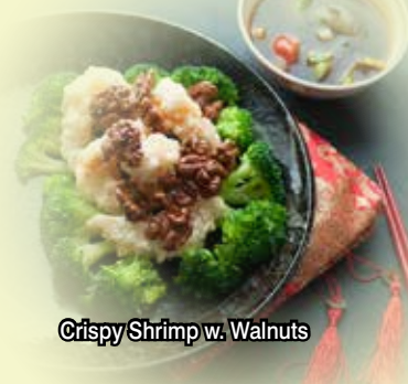
Crispy Shrimp w. Walnuts