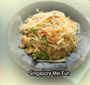
Singapore Mei Fun